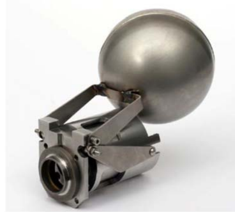
Max control unit